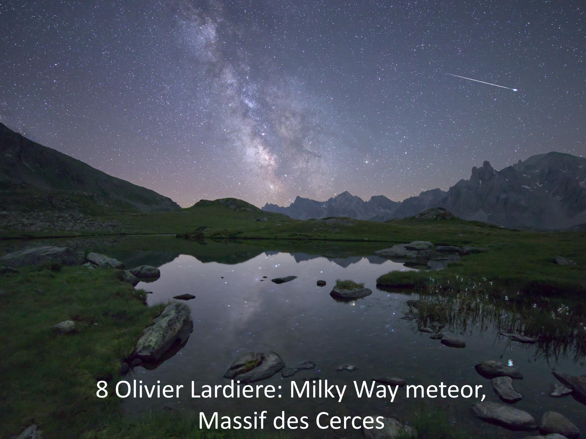
8 Olivier Lardiere: Milky Way meteor, Massif des Cerces