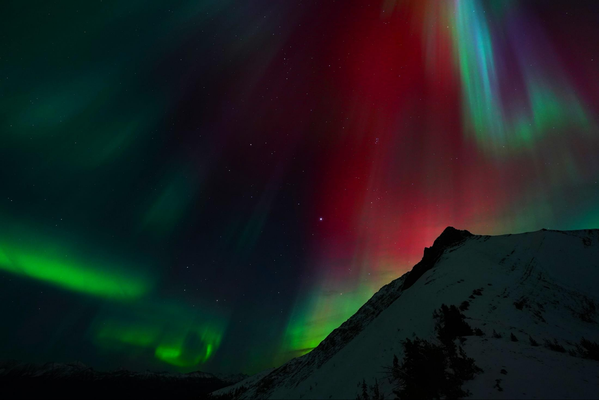
16 Jim Everard: Aurora framing Mount 7, Rocky Mtns