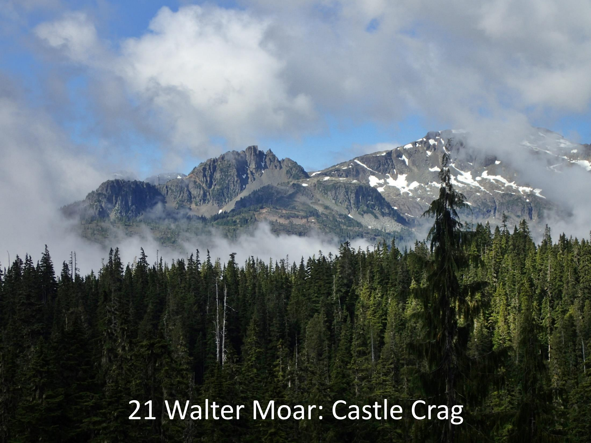
21 Walter Moar: Castle Crag