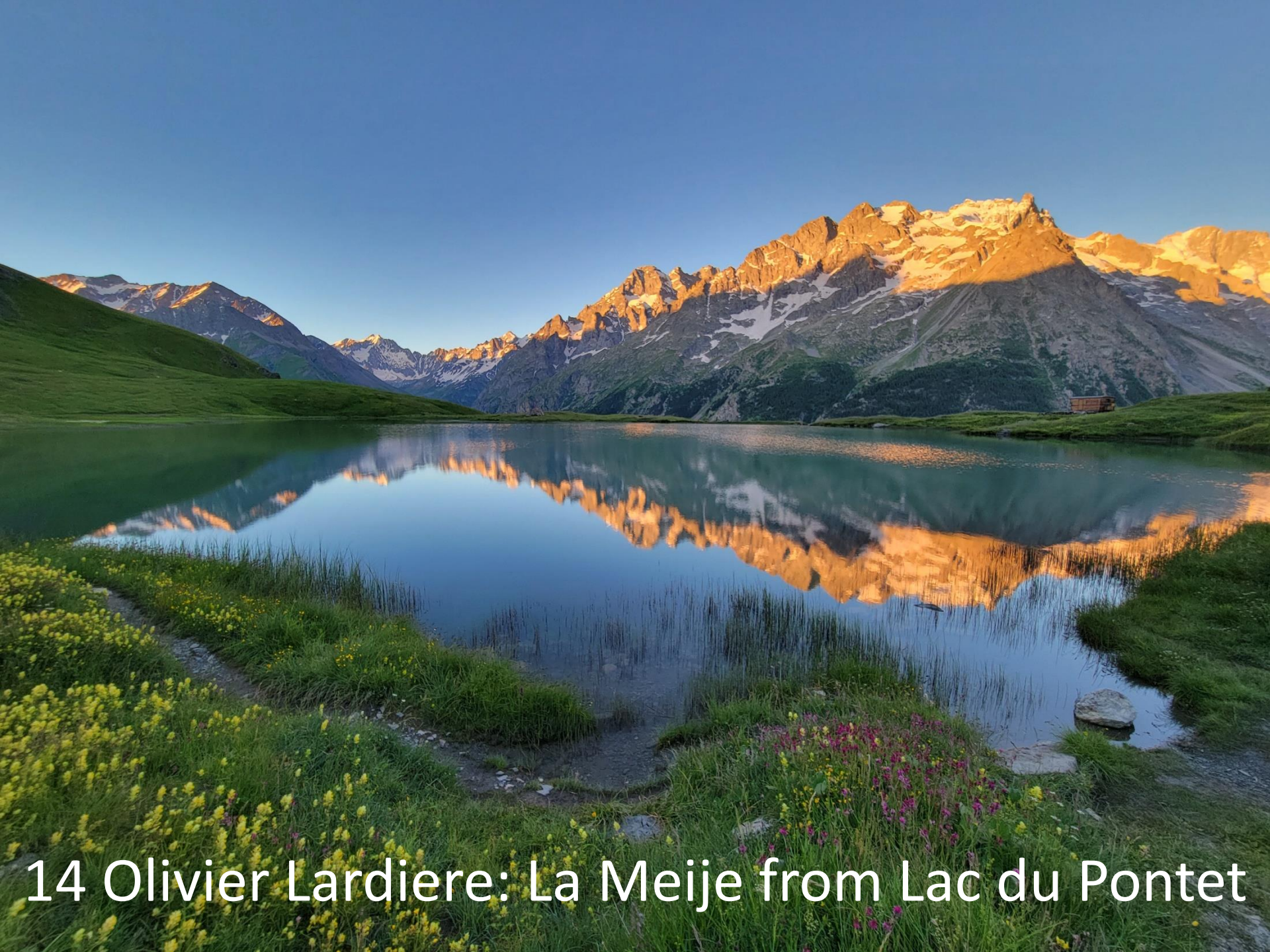
14 Olivier Lardiere: La Meije from Lac du Pontet