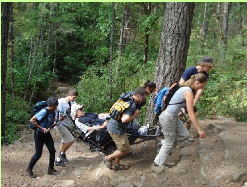
An ACC TrailRider team on the go.